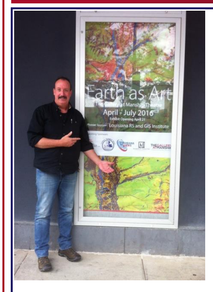
On display at the Manship Art Gallery in Baton Rouge, La. as part of the downtown exhibit from April to July, Spring 2016.