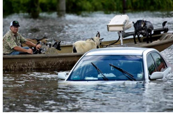
Pictured above and below are images showing the extent of damaging high water during the 2016 floods affecting people, property and livestock.

LouisianaView (LAView) responded to the Louisiana/Texas floods in March and May of 2016 and the Louisiana flood of August 2016. LouisianaView team members coordinated the activation of the International Charter as the state responded to each of these events. Working with state and federal consortium members, while supporting the response efforts of the Louisiana Army National Guard and State Emergency Response groups, LaView teamed forces with remote sensing specialist from the USGS Water & Aquatics Research Center and the TexasView consortium to analyze and provide Radar/Optical flood data to geospatial first responders.