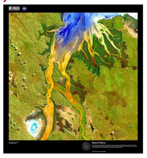
All anyone had to do .... was bring along their Imagination!

In much of the work we do, images from Satellites play a large role in the way we study climate change, weather patterns, natural and man-made disasters, timber stand health and man-kinds development and use of the Earth's resources. studying these images we also find many of the fundamental elements of fine art such as tonal quality, image composition and balance.