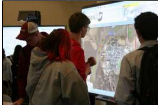
High School students use IndianaMap to work on 'Zombie Apocalypse' activity during Purdue's 2014 GIS Day.