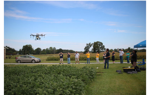
UAS Field Demo, Murray, Kentucky

We are developing workshop modules to improve K-16 education in the state. Also, more assessment tools have been developed. Remote sensing education and outreach activities, such as workshops, story maps, Earth Observation Day, Earth Day, and GIS Day presentations, have helped inform and educate teachers, students, and the public in Kentucky.