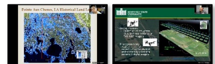
The 2022 EOD Virtual Event at MSU

KentuckyView is a member of the AmericaView Consortium, a nationally coordinated network of academic, agency, non-profit, and industry partners and cooperators that share the vision of promoting and supporting the use of remote sensing data and technology within each state. AmericaView is funded by USGS grant agreement G18AP00077.