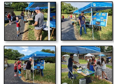
Archaeology Day event, Wickliffe, Kentucky