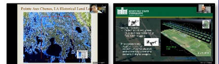
The 2022 EOD Virtual Event at MSU

KentuckyView is a member of the AmericaView Consortium, a nationally coordinated network of academic, agency, non-profit, and industry partners and cooperators that share the vision of promoting and supporting the use of remote sensing data and technology within each state. AmericaView is funded by USGS grant agreement G18AP00077.