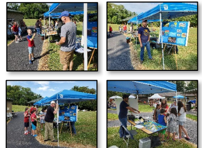
Archaeology Day event, Wickliffe, Kentucky