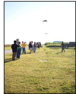
Train-the-Trainer sUAS Workshop