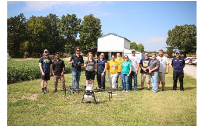
Train-the-Trainer sUAS Workshop