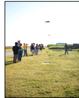
Train-the-Trainer sUAS Workshop