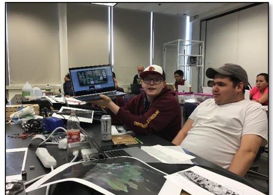
High-school student participants of 2019 Upward Bound College Bound program working on a lab on coastline erosion along Alaska's northern coastline.

Below pictures were taken during 2019 Science Potpourri event, EOD celebration, and ASRA student visit to EPSCoR VisSpace at University of Alaska Fairbanks campus.