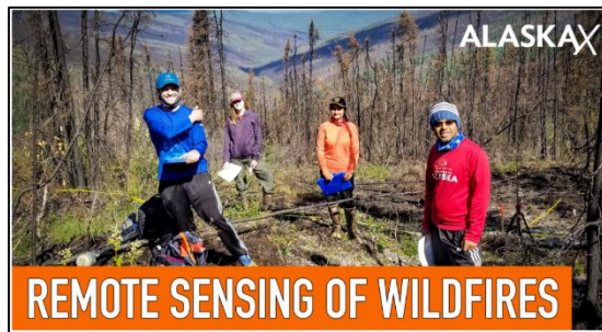
Course instructors surveying wildfire burn severity and shooting footage for the course.