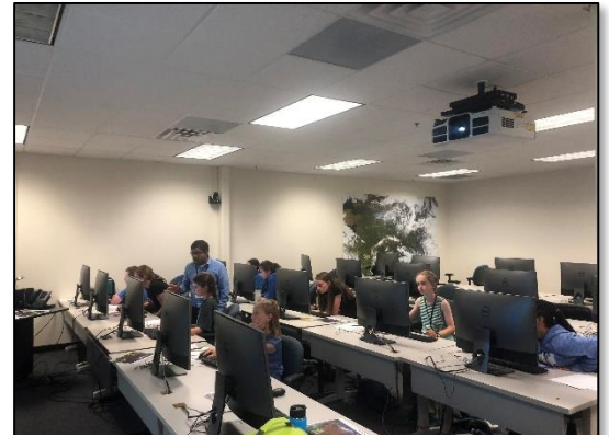
Middle-school student participants of 2019 Alaska Summer Research Academy working on a forest fire burn scar and burn severity mapping from pre- and post-fire Landsat images.

Consortium Development: Collaborated with UAF eCamups, edX.org, NSF Alaska EPSCoR program, and U.S. Fish and Wildlife Service.