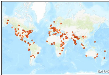
Map showing Image Analysis learner locations.

Both courses are self-paced (consisting of video lectures, illustrations, interactive exercises, and quizzes).